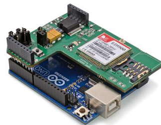
FIG 3:GAS SENSOR

MQ-4 sensor: MQ-4as the sensitive component and has a protection resistor and an adjustable resistor on board. The MQ-4gas sensor is sensitive to CNG, I -butane, propane,