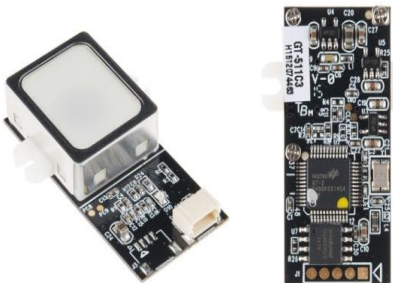
FIG 6:FINGERPRINT SENSOR

Fingerprint Scanner: Fingerprint scanners are awesome. Why use a key when you have one right at the tip of your finger? Unfortunately, they're usually unreliable or difficult to implement. Well not anymore! We've found this great fingerprint module from ADH-Tech that communicates over TTL Serial so you can easily embed it into your next project.