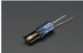
FIG 5:VIBRATION SENSOR

Vibration sensor: This basic piezo sensor is often used for flex, touch, vibration and shock measurements. A small AC and large voltage (up to +/-90V) is created when the film moves back and forth. A simple resistor should get the voltage down to ADC levels. Can also be used for impact sensing or a flexible switch. Comes with solder able crimp pins and a mass attached to the tip. This mass increases the sensitivity to motion.