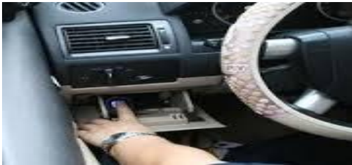
FIG 7: IMPLEMENTATION IN CAR

The vehicle tracking system consists of a GPS receiver which provides real time position of the automobile.