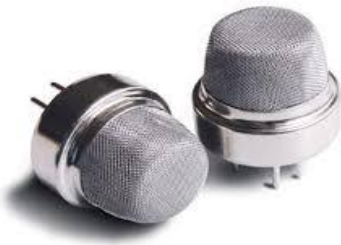
FIG 1:BLOCK DIAGRAM