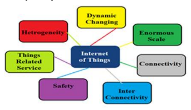
Fig 1. Characteristics of IoT

The Internet of Things (IoT) is a network of real-world items, including furniture, machinery, cars, and buildings, equipped with electronics, sensors, and network connections to gather and share data. These connected devices create a system that can be monitored and managed remotely, making them smarter, more efficient, and autonomous. IoT enables smart homes, connected cars, wearable technologies, and industrial automation, improving decision-making and productivity. From common household items to high-tech business gear, IoT encompasses a wide range of physical objects embedded with software and sensors for communication and data exchange through the internet.[52]