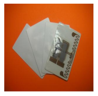
Figure 5. BAP Tag

Battery-Assisted Passive (BAP) RFID: A third, hybrid type of RFID tag has also emerged. BAP systems, or semipassive RFID systems, incorporate a power source into a passive tag configuration. The power source helps ensure that all of the captured energy from the reader can be used to reflect the signal, which improves read distance and data transfer rates. Unlike active RFID transponders, BAP tags do not have their own transmitters.