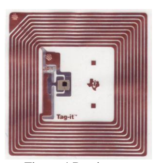
Figure 4.Passive tag

Passive RFID: In passive RFID solutions, the reader and reader antenna send a signal to the tag, and that signal is used to power on the tag and reflects energy back to the reader. There are passive LF, HF, and UHF systems. Read ranges are shorter than with active tags and are limited by the power of the radio signal reflected back to the reader (commonly referred to as tag backscatter).Passive tags are usually smaller, less expensive, and more flexible than active tags. This means they can be attached or even embedded on a wider variety of objects. Passive UHF tags are commonly used for item-level tracking of consumer goods and pharmaceuticals, for example.